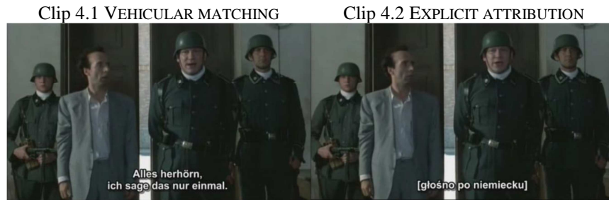
Figure 4: Vehicular matching versus explicit attribution in Life is beautiful