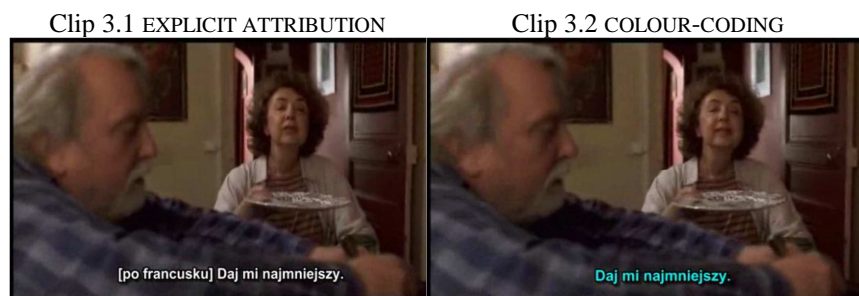
Figure 3: Explicit attribution of language versus colour-coding in 2 Days in Paris

Polish hearing viewers were provided with a subtitled translation of both English and French dialogue. When preparing subtitles for the hearing-impaired, it seems crucial that the viewers be informed about the bilingual nature of the dialogue, constant code-switching and any resultant miscomprehension/confusion when characters are trying to communicate. Traditionally, the presence of a foreign language is marked in SDH using the explicit attribution strategy, which was the first option in our study. Another option was the strategy of colour-coding, where all the French dialogue was translated into Polish and marked in blue, as opposed to the traditional whiteness of utterances translated from English: