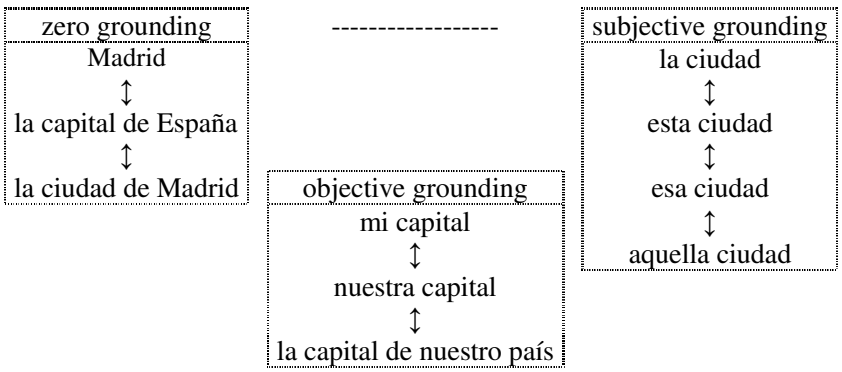
Figure 4: some instances of zero, objective and subjective grounding

The result of this approach is a tripolar system. As we see in figure 4, it is possible to make more subdivisions, but these oppositions are beyond the scope of this paper.